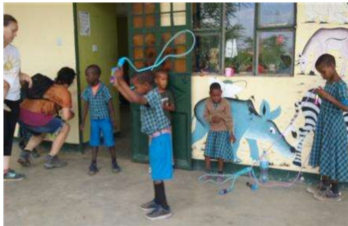
Bandari School Project in Tanzania