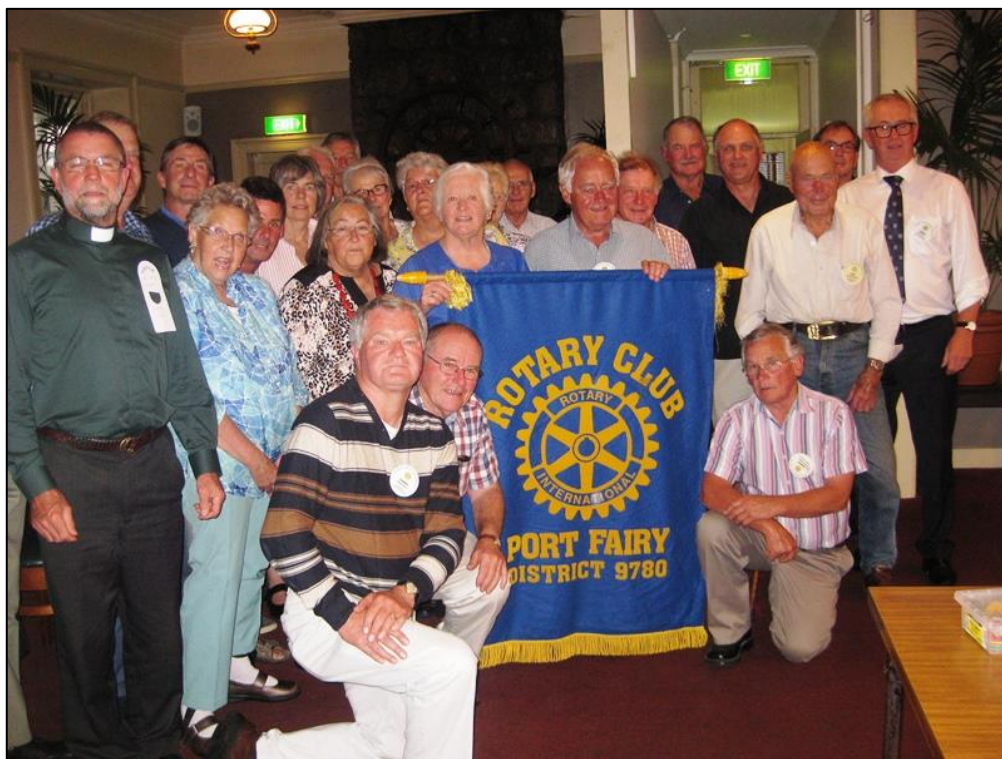
Club members and guests (Dinner Meeting February 2015)

The Rotary Club of Port Fairy is grateful for the support of Star Printing in the production of this booklet