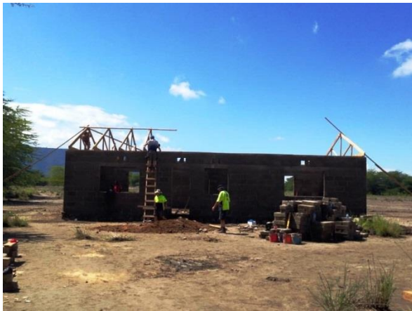
Rotarians help build kindergarten in Mto Wambu Tanzania