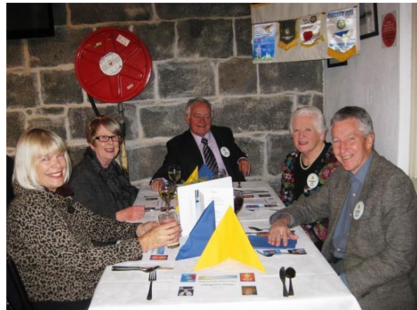
Rotarians and partners enjoy the 2014 Changeover Dinner