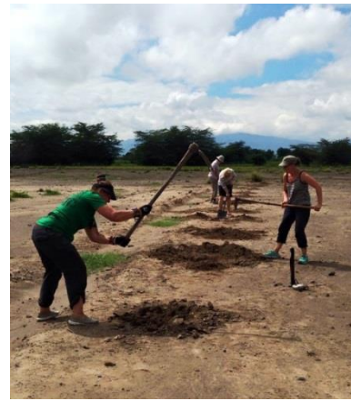
Rotarians and friends working hard in Mto Wambu, Tanzania