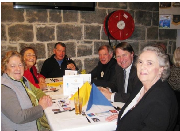
Rotarians, partners and guests enjoy the 2014 Changeover Dinner