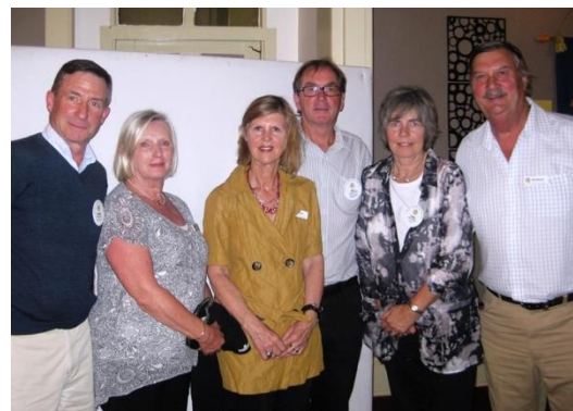
New members and partners (Feb 2015)