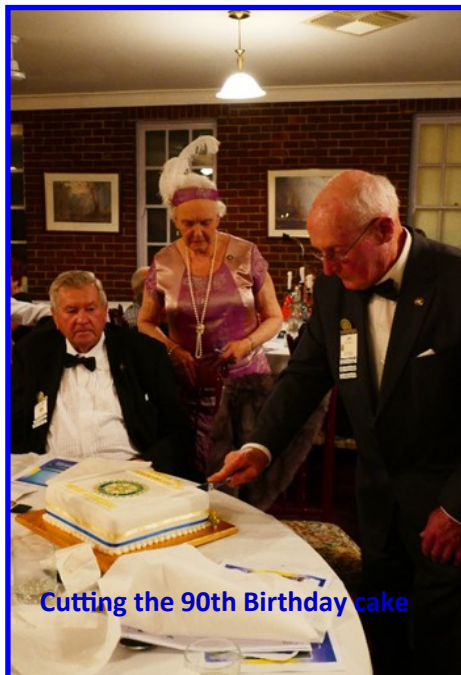
Cutting the 90th Birthday cake