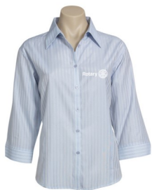
LADIES DRESS SHIRT

http://rdusupplies.com.au/apparel/clothing/