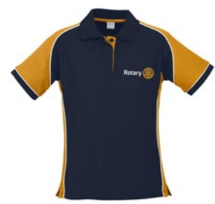
STYLE 2 LADIES

There are several other items available- dress shirts, polar fleece, vests, long sleeved T shirts and a light weight jacket.