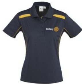
STYLE 1 LADIES