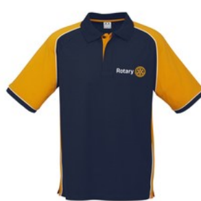
STYLE 2 MEN