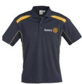
STYLE 1 MEN

A decision will most likely be made at the coming Board meeting, so contact a Board member if you have any comments.