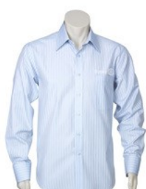
MENS DRESS SHIRT