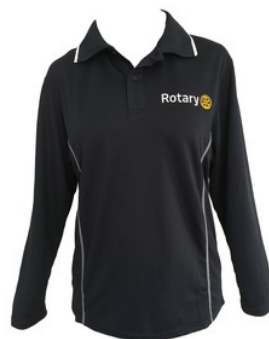
LONG SLEEVED TEE