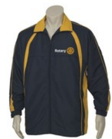
LIGHT WEIGHT JACKET