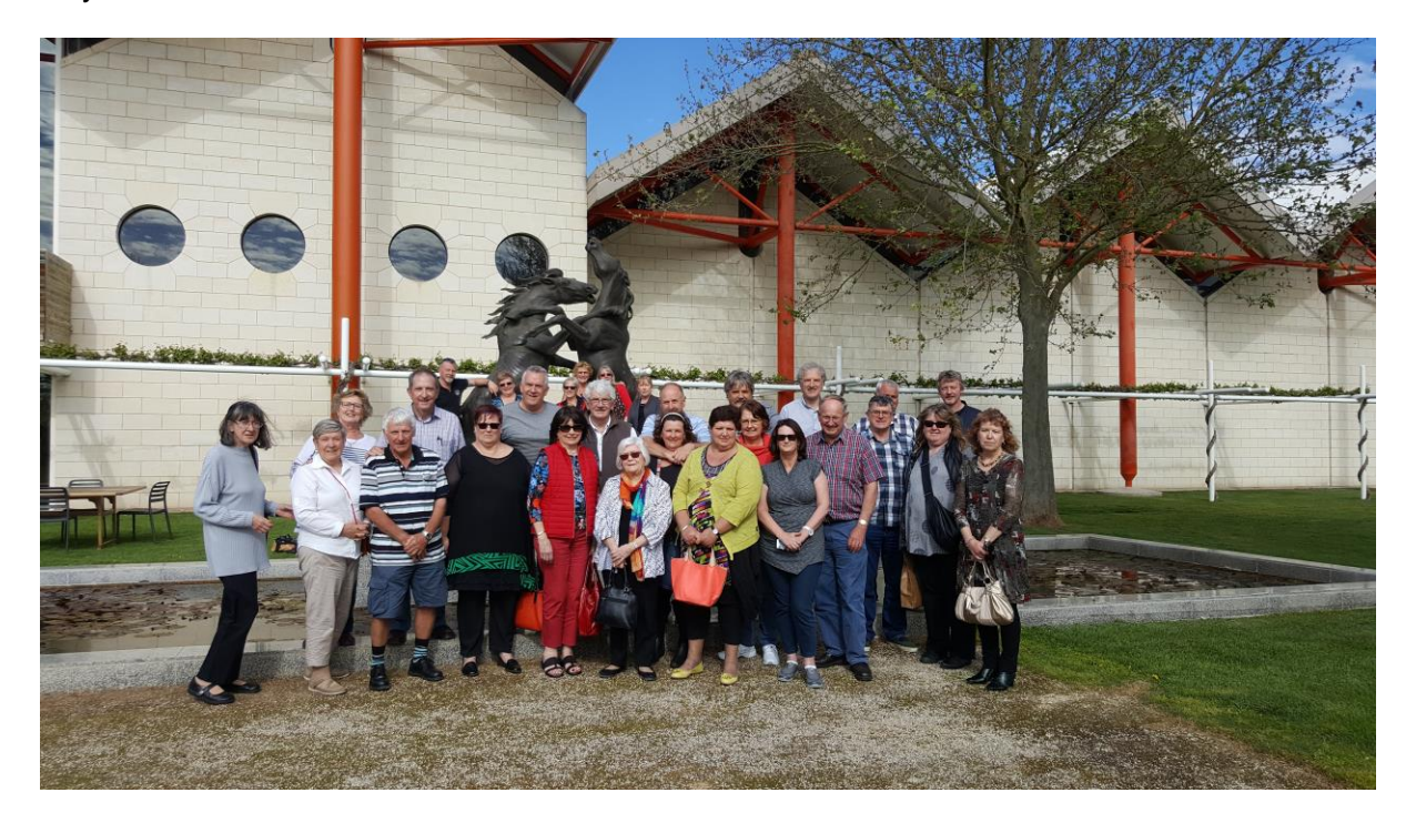
Group who attended the Coonawarra trip.

At the time of writing this report, plans are underway for a proposed weekend in the Daylesford area.