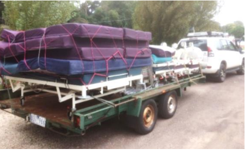
Two separate loads of DIK goods on their way to the Geelong depot