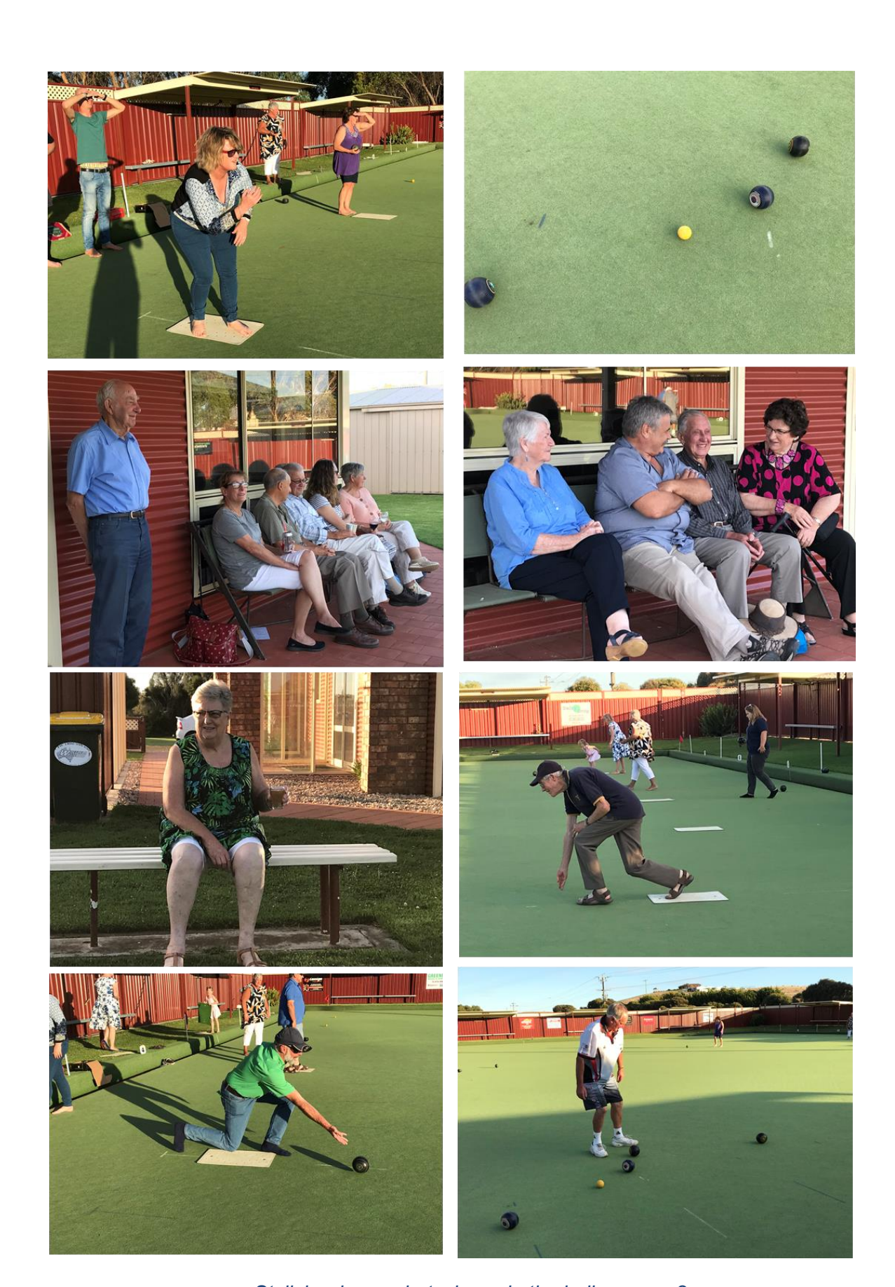
Stylish releases but where do the balls go.....?