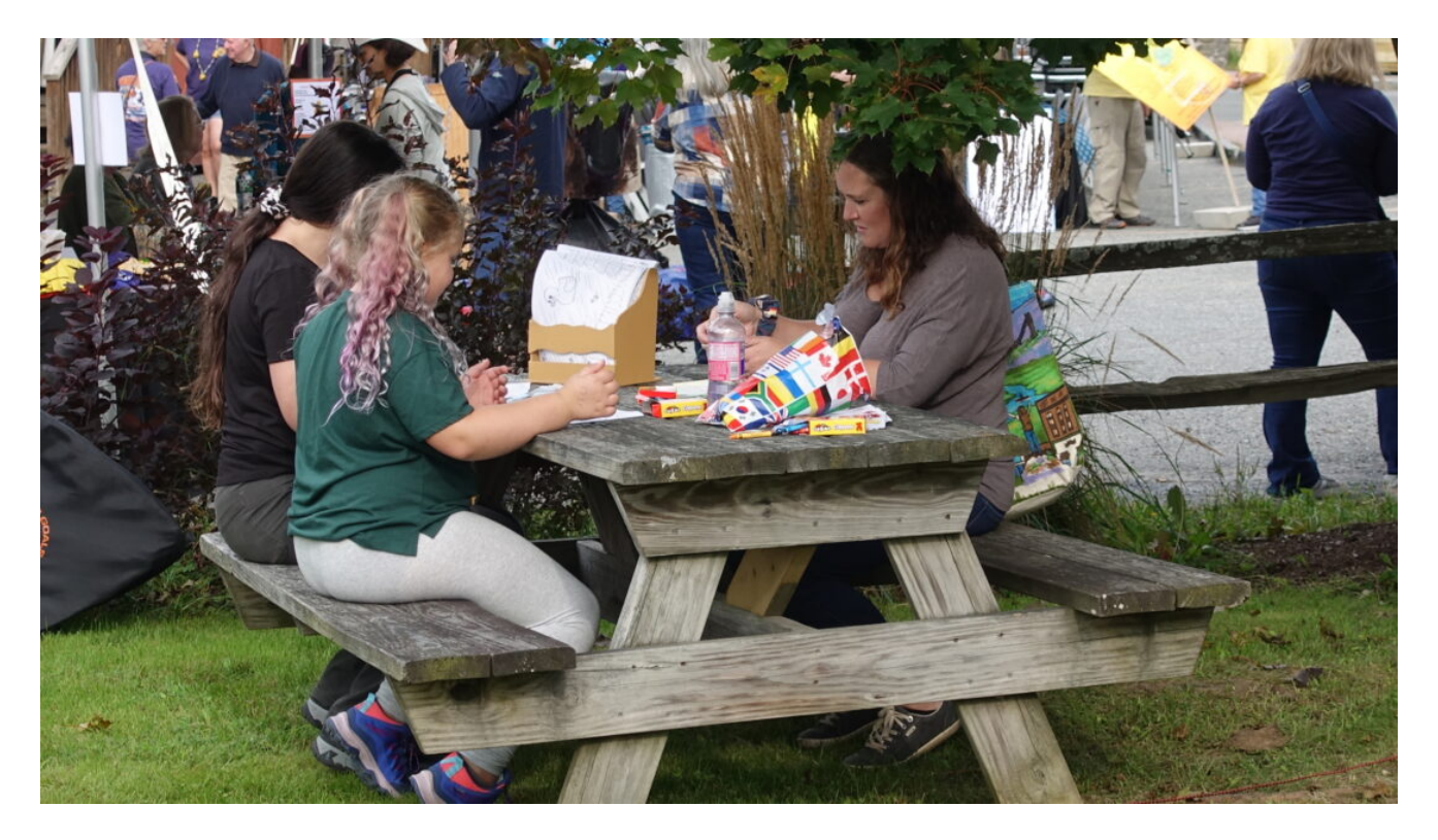
Here is a scene from the Lake Placid Rotary Club's 2023 Dam Duck Race, which was held on Sept. 23. (Provided photo)