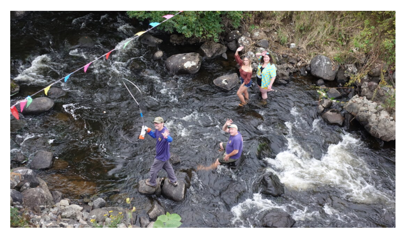
Here is a scene from the Lake Placid Rotary Club's 2023 Dam Duck Race, which was held on Sept. 23.