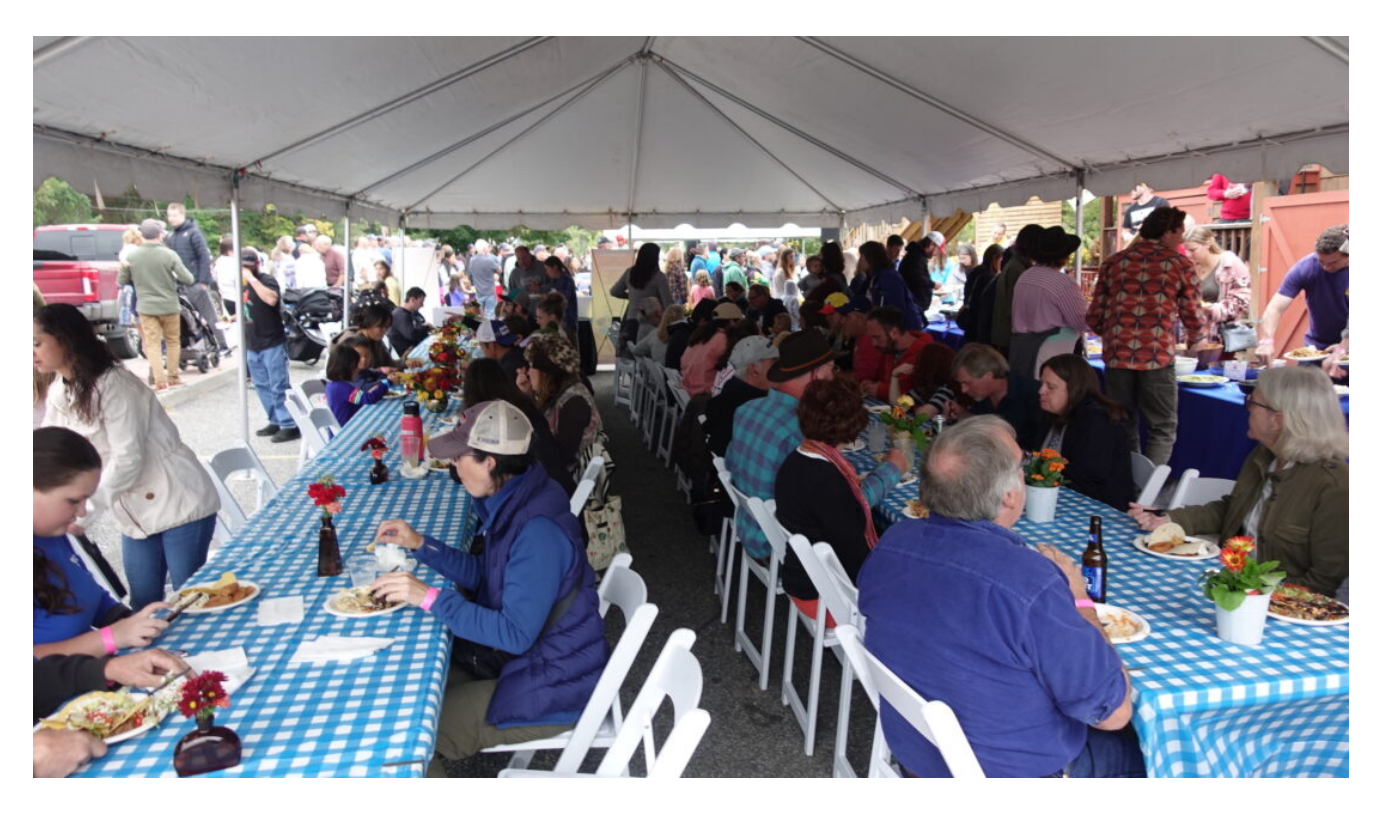
Here is a scene from the Lake Placid Rotary Club's 2023 Dam Duck Race, which was held on Sept. 23.