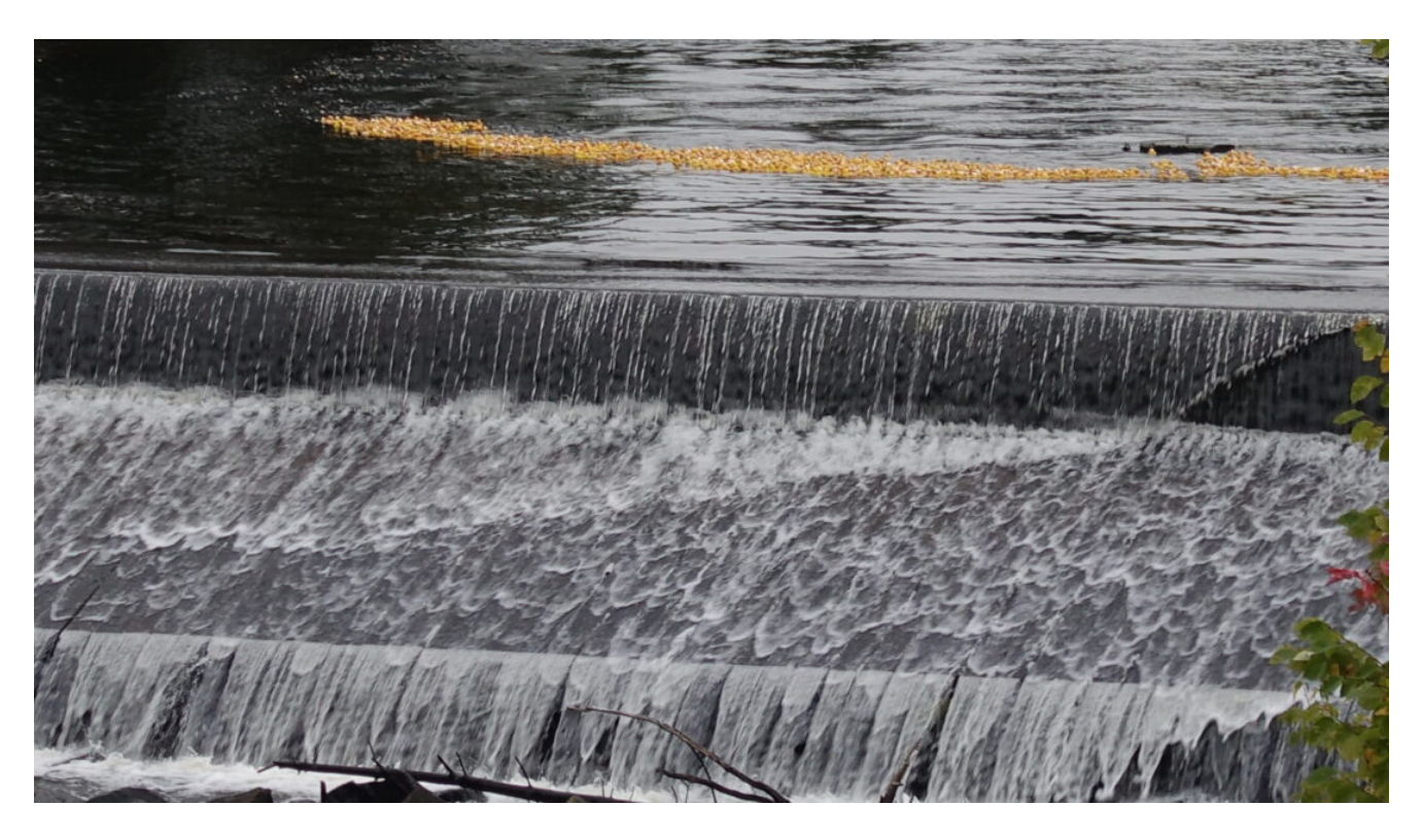
Here is a scene from the Lake Placid Rotary Club's 2023 Dam Duck Race, which was held on Sept. 23.

This year, organizers upped the amount of ducks from 1,500 to 1,750 to see if they could sell more. The strategy worked. The ducks sold out just before race time, according to McKillip.