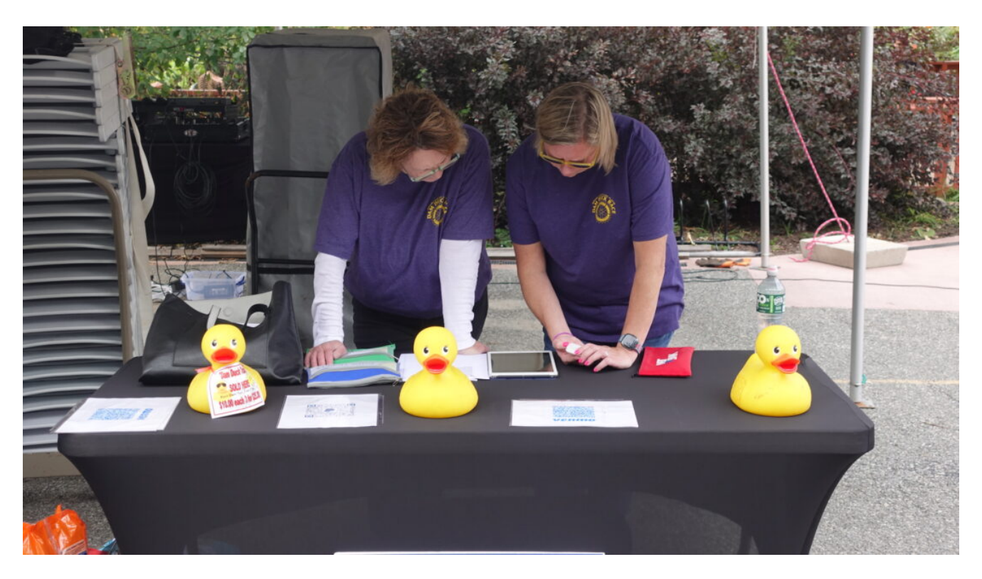
Here is a scene from the Lake Placid Rotary Club's 2023 Dam Duck Race, which was held on Sept. 23.