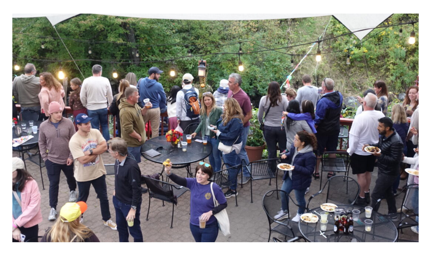
Here is a scene from the Lake Placid Rotary Club's 2023 Dam Duck Race, which was held on Sept. 23.