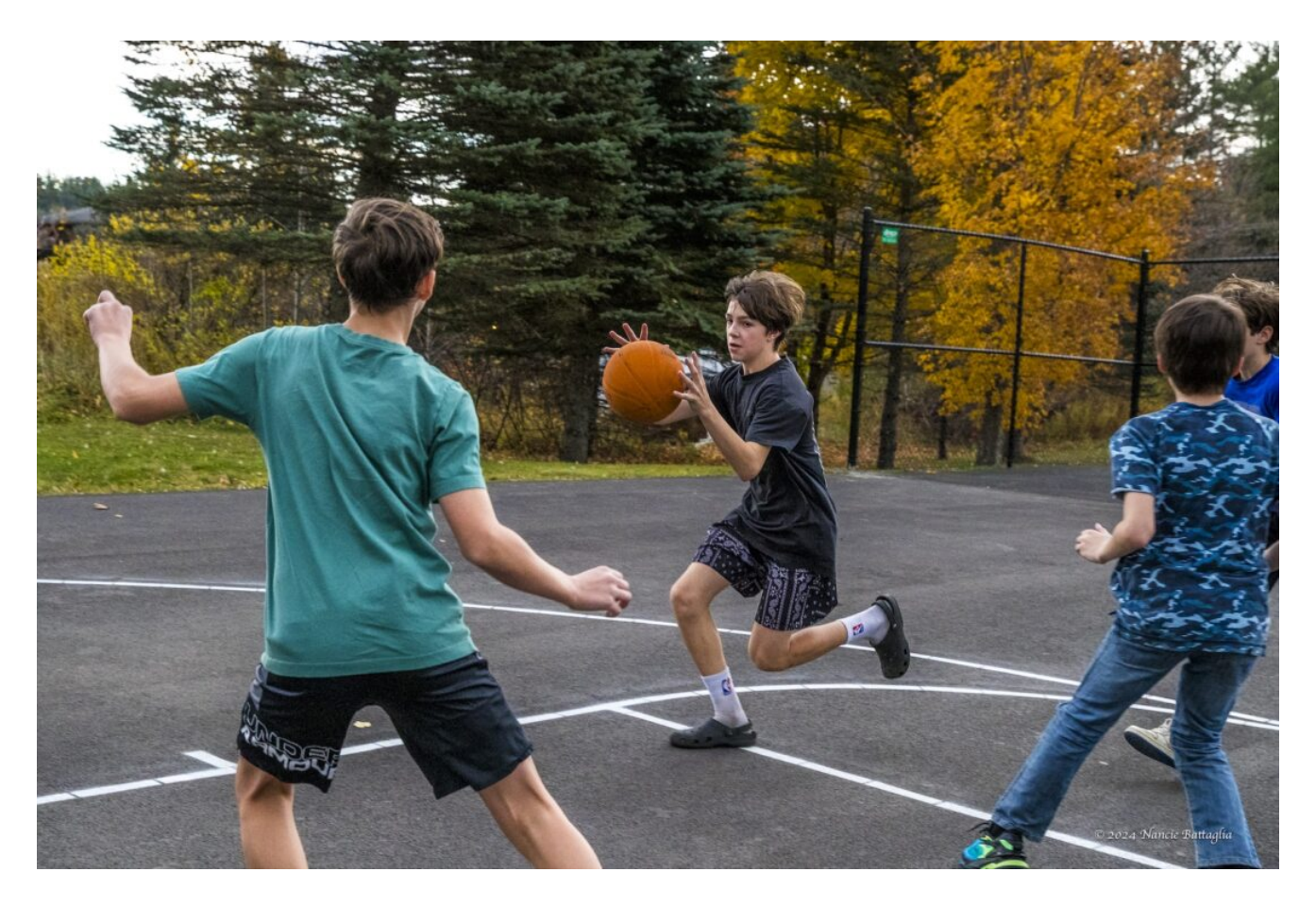
Lake Placid area kids gathered and/or play basketball.

and walkability to green spaces is so important for the health of our students. Thanks to municipal and community partners like the Town of North Elba, Village of Lake Placid, and Rotary Club of Lake Placid this dream came to fruition."