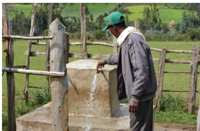
Clean spring water in Acheber, Ethiopia, delivered to the community via gravity and Rotary Club members of Sacramento.

After witnessing what transpired in Acheber, another nearby village sent its elders to ask for help. While Seifu translated, the Rotary team listened and promised to help, provided the community contributed labor and local materials. The Rotary Club of Sacramento kept its promise and donated $5,000 in seed money, and the village is raising its own donations towards their goal.