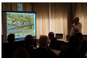
Bridge to Prosperity