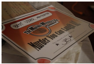
2015 Christmas Party