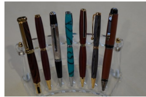
The Handmade Pens