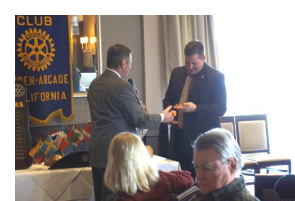
4 Way Test Coin