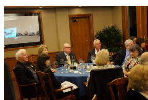
Good to see you guys!