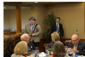
RIO Jazz Band