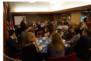
Enjoying the party!