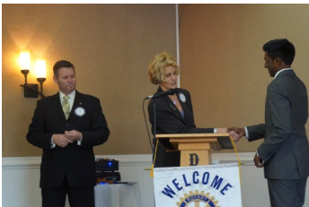
Moving on to District