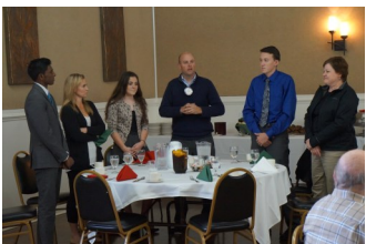
Students and parents