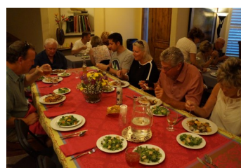
Good friend and conversation!