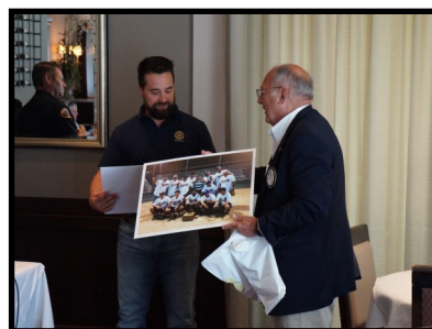
Team Photo presentation