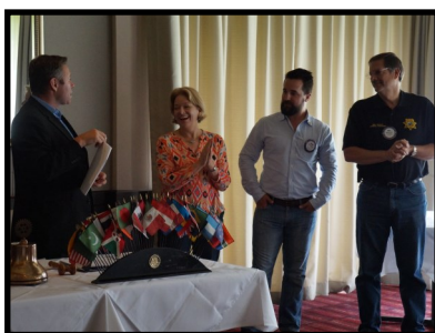
Congratulations on the $25,000 Grant!