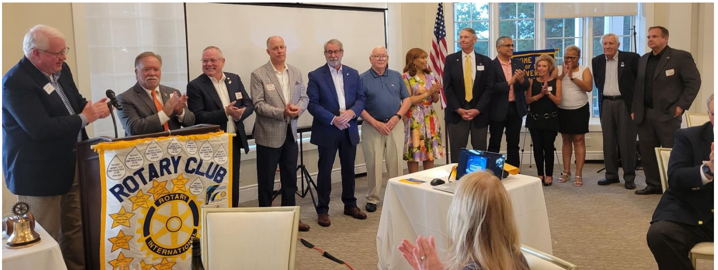
2025/2026 Officers and Committee Chairpersons