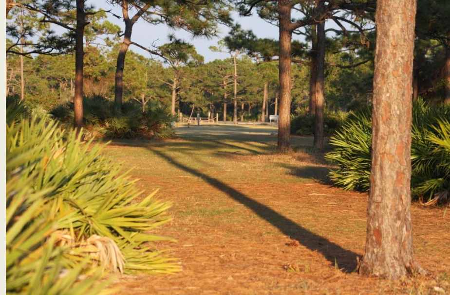
Wickham Park Men's and Women's Cross Country