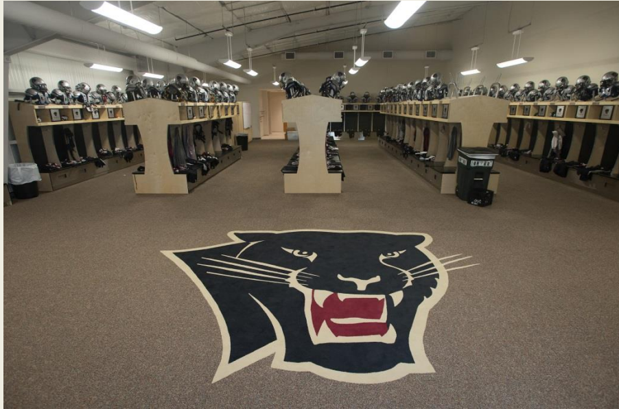
Football Locker Room