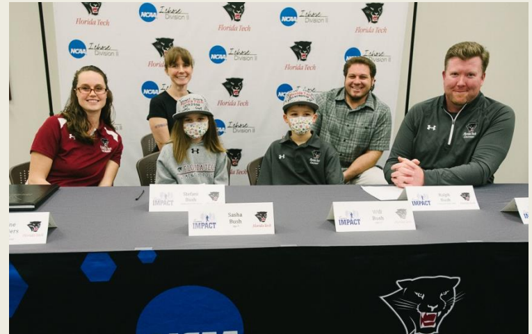
Team Impact with Lacrosse