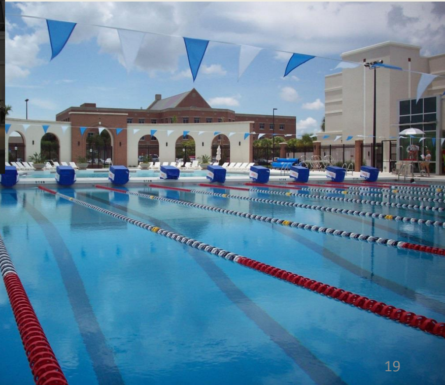
Panther Aquatic Center Swimming