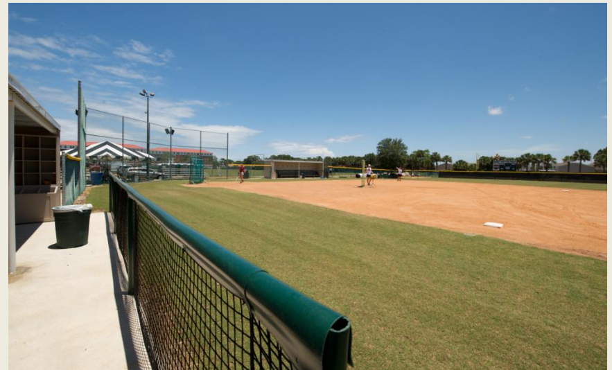
Nancy Bottge Field