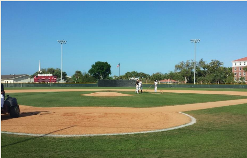
Andy Seminick-Les Hall Field