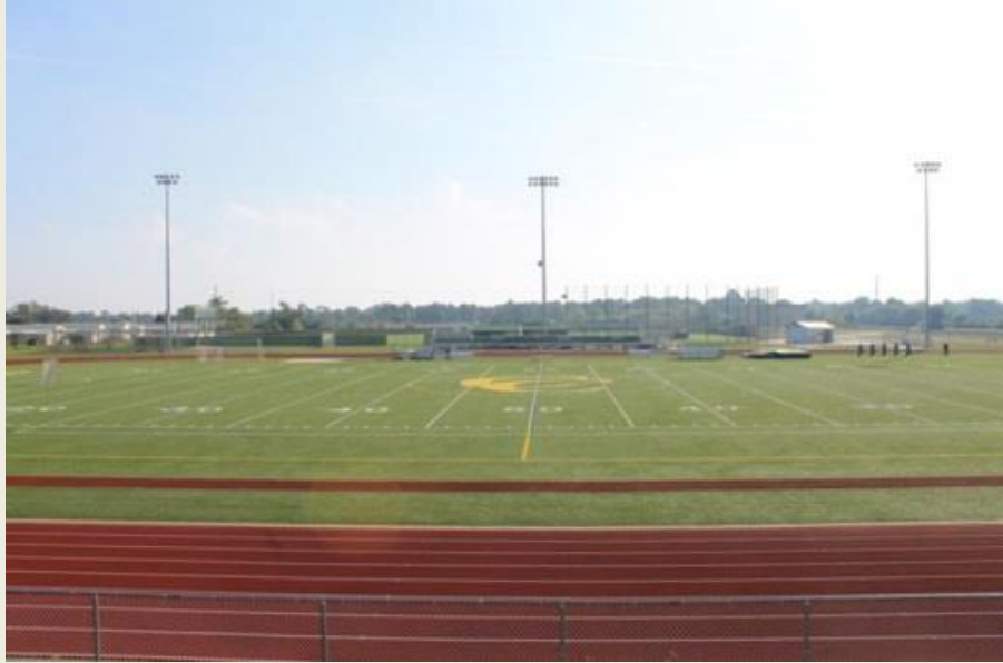
Melbourne Central Catholic Men's and Women's Track & Field