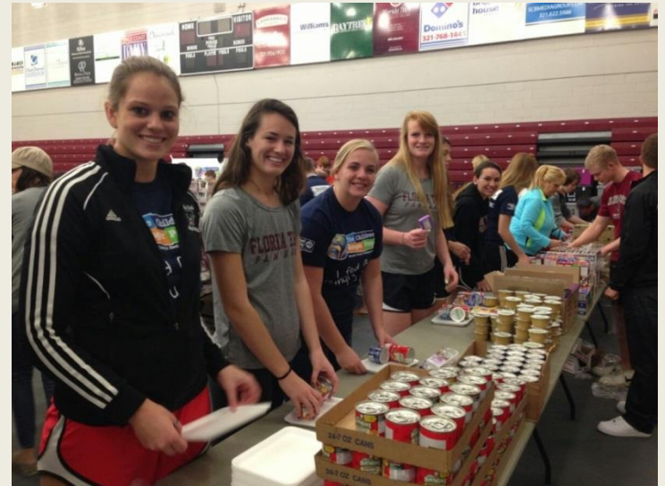
Children's Hunger Project