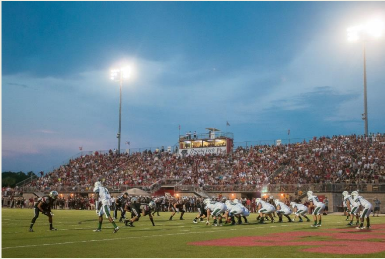
Palm Bay High School's Pirate Stadium Football and Men's and Women's Lacrosse