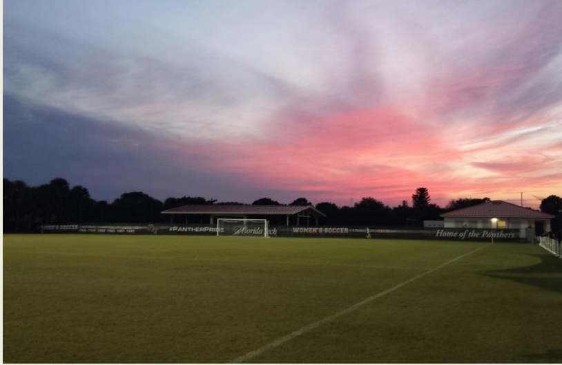
Rick Stottler Soccer Field