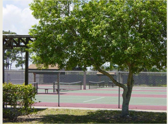
DeSoto Tennis Courts Tennis also uses Kiwi Tennis Club and Fee Ave.