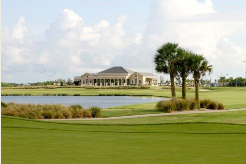
Duran Golf Club