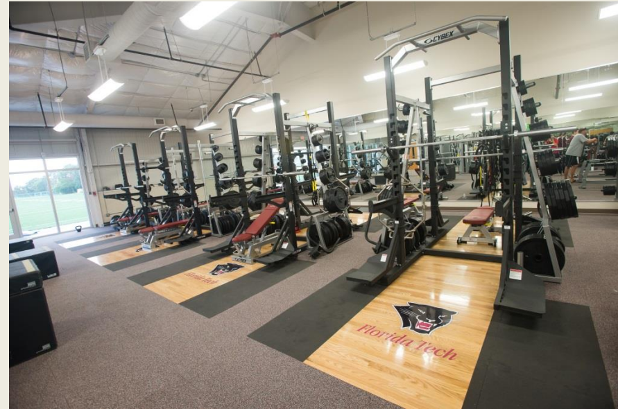
All Sports Weight Room