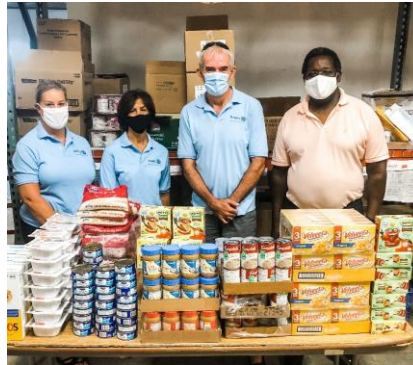
Packing Backpacks for nutritionally at risk children in New Paltz