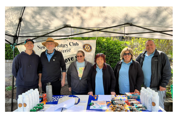
5K Walk/Run at Rotary Park

If you enjoy working with others to make a difference in the local community and in the world and you like to help advance international understanding and world peace, then you should consider joining Rotary.