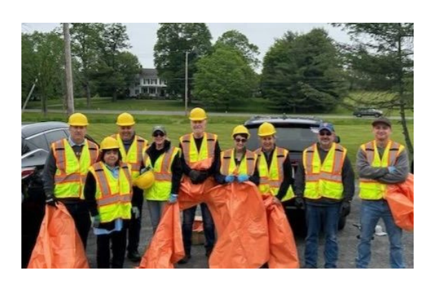
Rotary Day of Service

Rotary is an international organization with more than 1.2 million members and over 35,000 local clubs. Each club focuses on service within its own community and on solving international challenges.