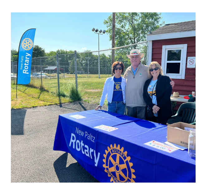
Touch A Truck

Donations accepted through: Venmo: @NewPaltzRotaryFoundation-1 PayPal: @NewPaltzRotaryFoundation