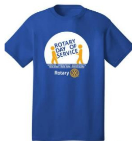
Rotary Day of Service 2023 Short Sleeve T-shirt