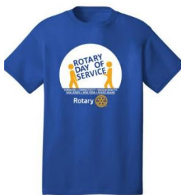
Rotary Day of Service 2023 Short Sleeve T-shirt