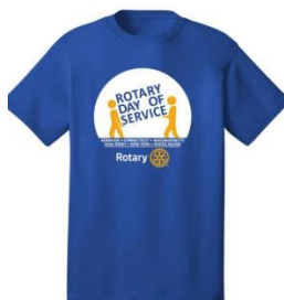
Rotary Day of Service 2023 Short Sleeve T-shirt

The Rotary Day of Service is May 20 th . We are formulating what service project(s) we will undertake. Meanwhile, you can have this lovely Day of Service T-shirt for just $10.00 cash or check (payable to Red Hook Rotary Club). Reserve yours today by emailing Jen Van Voorhis at jennv4@hotmail.com