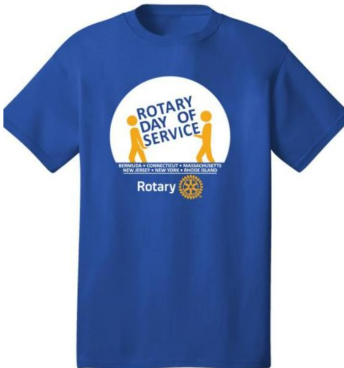
Rotary Day of Service 2023 Short Sleeve T-shirt

The Rotary Day of Service is May 20 th . We are formulating what service project(s) we will undertake. Meanwhile, you can have this lovely Day of Service T-shirt for just $10.00 cash or check (payable to Red Hook Rotary Club). Reserve yours today by emailing Jen Van Voorhis at jennv4@hotmail.com