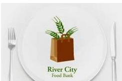
Because no one should be hungry

vegetables will be donated to the River City Food Bank.