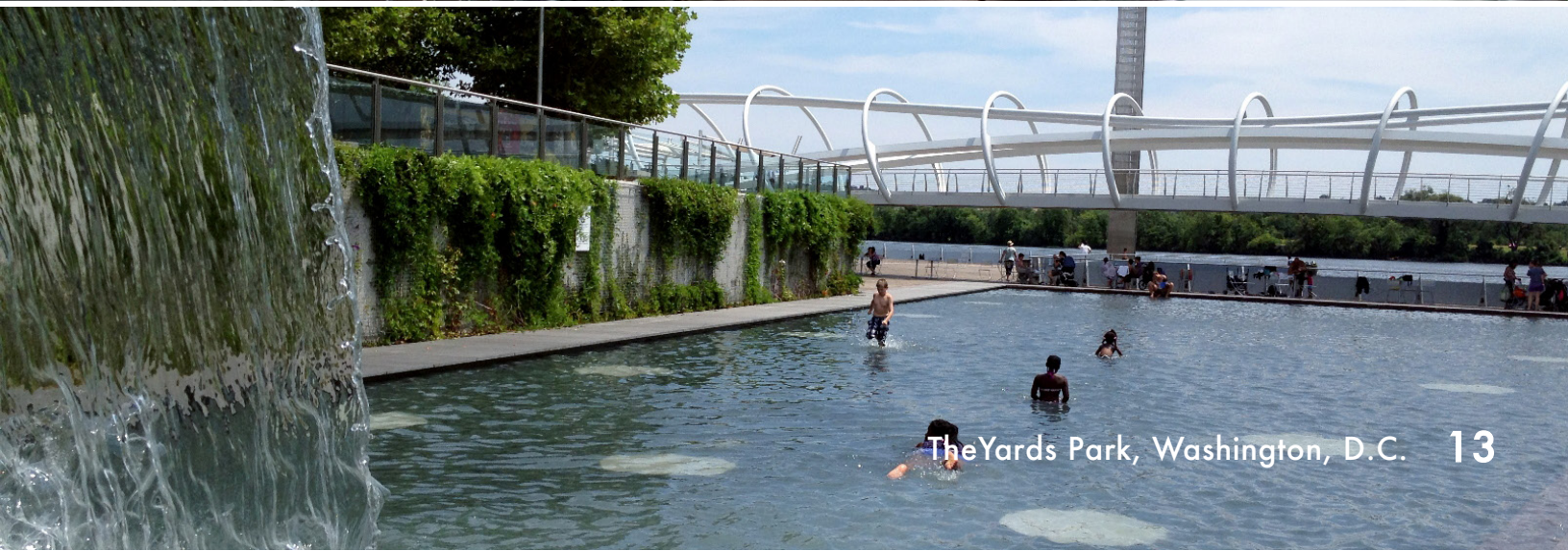
The Yards Park, Washington, D.C. 13