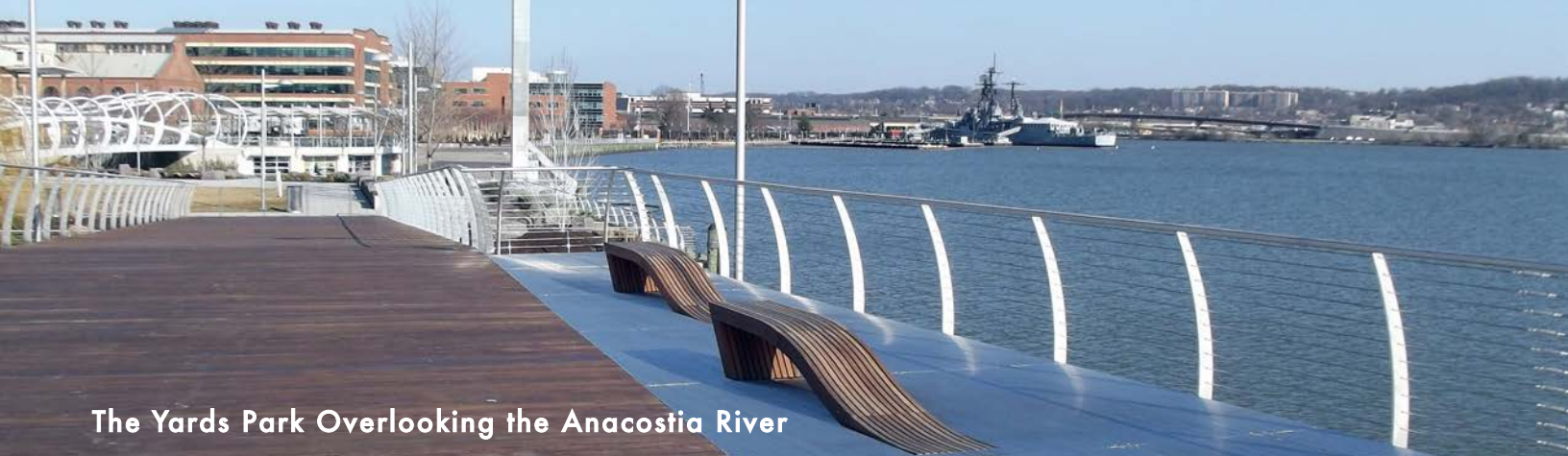
The Yards Park Overlooking the Anacostia River