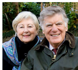
New RI President

Our next Flag day is September 7 th Labor Day!