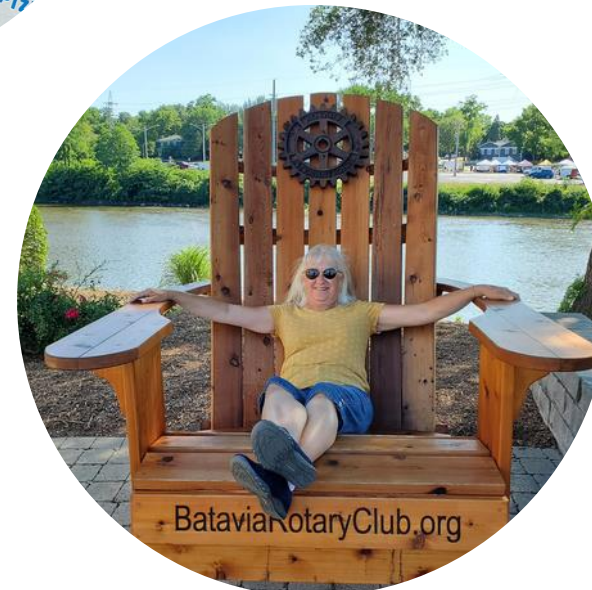
Stain a Chair