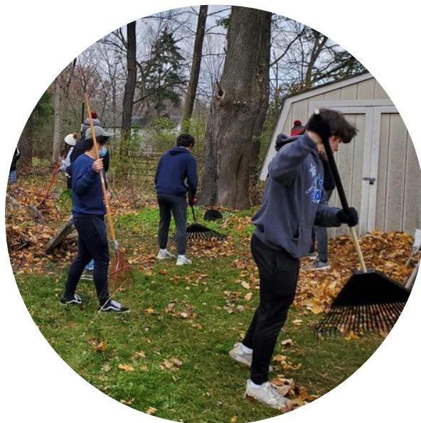
Thanksgiving Yard Cleanup