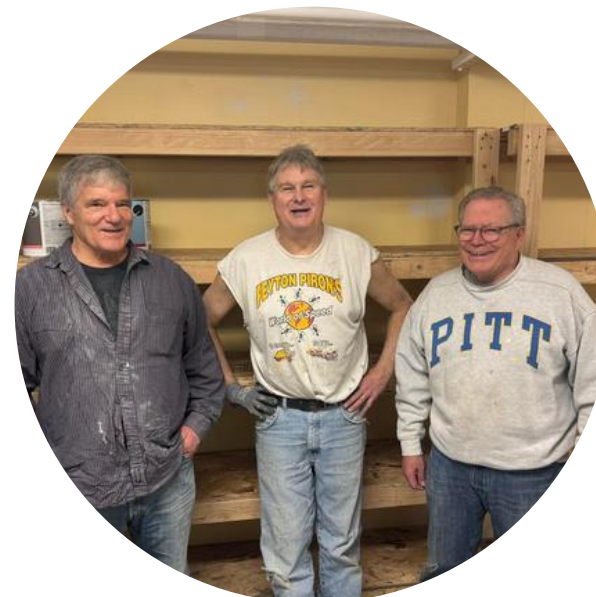
Painting at the Food Pantry