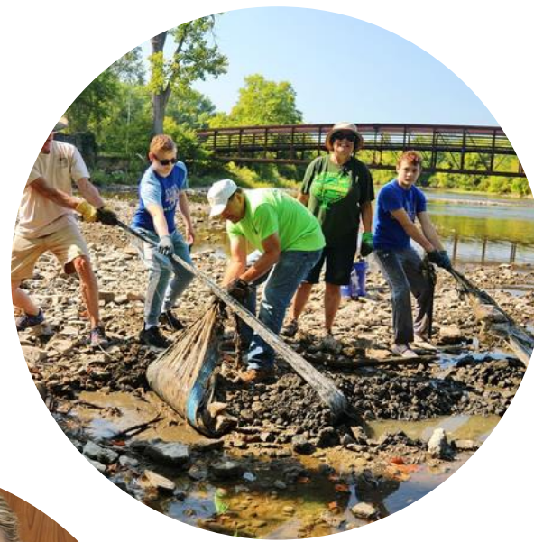
Fox River Cleanup