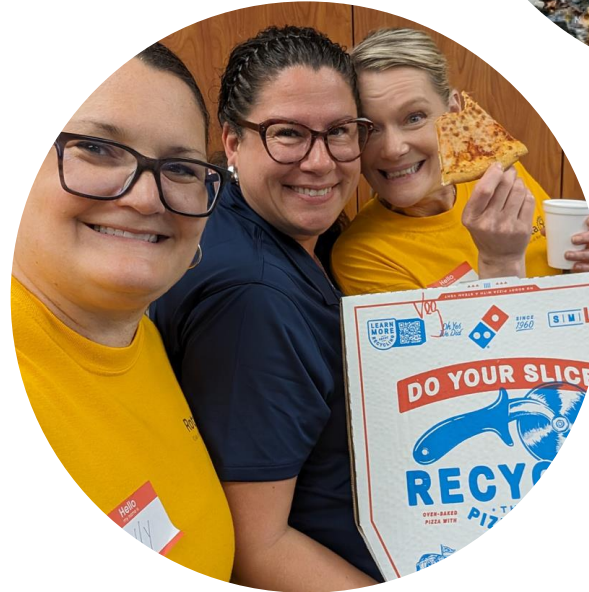
Mail Carrier Food Drive