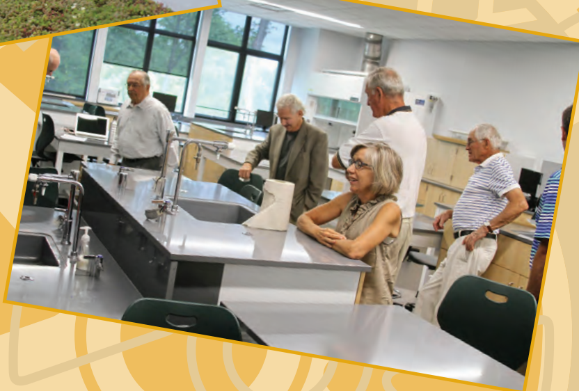
Inside one of the science labs in the new Science Wing at Glenbard West