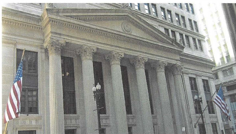
The Federal Reserve Bank of Chicago