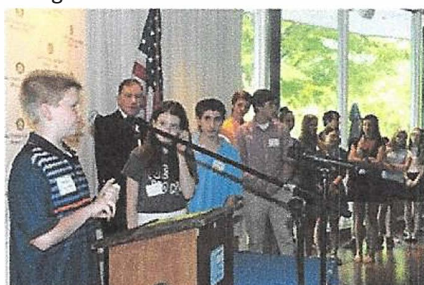
Youth Service Recognition Awards ceremony, an annual event.

We invite you to support the Lake Forest-Lake Bluff Rotary's philanthropic mission. For the past 62 years, the Rotary has given over $1 million to improve the lives of others in our community and our world. You won't want to miss this unique opportunity to promote your business to this dynamic and affluent audience. The Lake Forest-Lake Bluff Rotary Club is part of Rotary International, a worldwide organization of more than 1.2 million business, professional, and community leaders. Members of Rotary Clubs, known as Rotarians, provide humanitarian service, encourage high ethical standards in all vocations, and help build goodwill and peace throughout the world. There are 35,000 Rotary Clubs in more than 200 countries and geographic areas. Clubs are open to all. As signified by the motto Service Above Self, Rotary's main objective is service: in the community, in the workplace, and throughout the world.