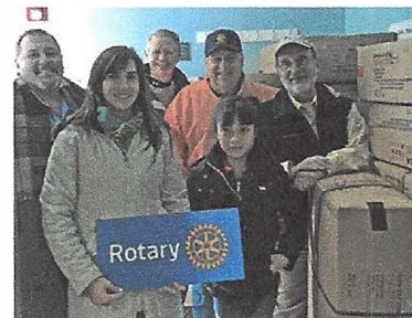
Delivery of winter coats to children in North Chicago and Highwood through Operation Warm -Past 12 years