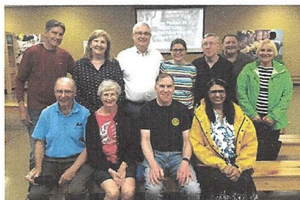
Club members making a difference by helping out at Feed My Starving Children.