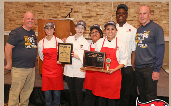
Palatine High School Palatine

D211 High Schools Culinary Arts Program Division