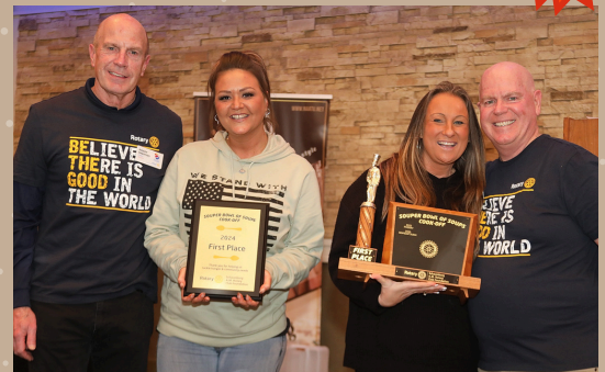
Bar Down Sports Grill Hoffman Estates