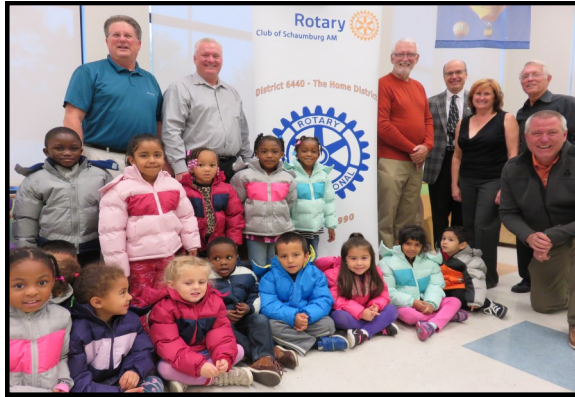
Club members donate new winter coats, sourced through Operation Warm, to at-risk children from low income families.

To date our club and its members have donated in excess of $475,000 to support local, regional and international projects and programs, in addition to providing need-based vocational scholarship assistance to students pursuing an accredited career or vocational program at a local community college or regional trade school. Our weekly breakfast meetings include fun, fellowship and interesting programs dealing with topics of local and global importance.