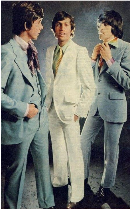
A man for each mood... Three piece green suit, £38. Pink thick cotton shirt, 66. Printed scarf, £3 from Just Men. White suit, £30 at Way In, Knightsbridge, London, S.W.1. Green self-stripe shirt, £4, Sydney Smith. Striped schoolboy tie, 16s. 6d., Take Six. Brown patent shoes, £11 11s., Elliott. Grey fitted velvet suit, £18 18s., from Take Six, London. Patchwork silk shirt, 29 9s. by Mother Wouldn't Like It, from Kings, London, S.W.3.

Fashion from 1969 included a lot of detailed patterns, solid colors, flared pants, long necklaces, loose fitting clothes, headbands, stacked bracelets, many rings, dangling earrings, tie dye, brown suede and beading, stripes and unstyled hair