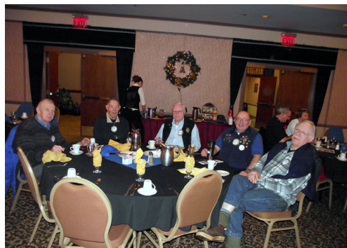
Juneau Rotary members at the year-end meeting on December 29, 2015