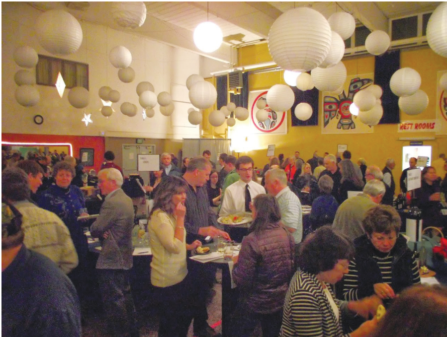
Rotarians, their friends and other members of the Juneau community enjoy good food and great company while waiting for the 2014 Rotary Wine Auction to kick off.