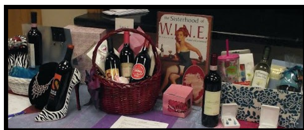
ABOVE: Scenes from the 2013 Wine Auction. A GREAT time was had by all!