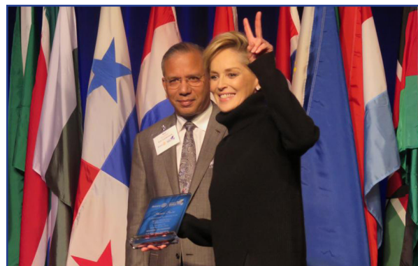
Actress and humanitarian Sharon Stone gives the peace sign after speaking at the Rotary World Peace Conference on 15 January in Ontario, California, USA.

Less than two months later, an event nearby focused on peace: the Rotary World Peace Conference. The two-day meeting on 15-16 January brought together experts from around the world to explore ideas and solutions to violence and conflict.