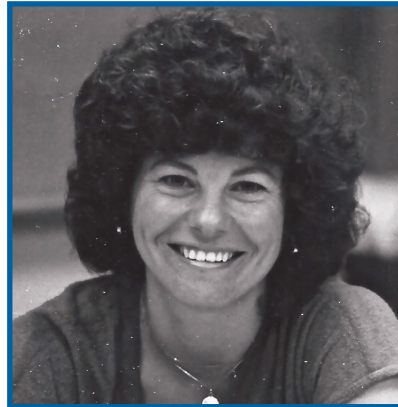
Woodland High School photo 1986, same time as trip to Alaska.