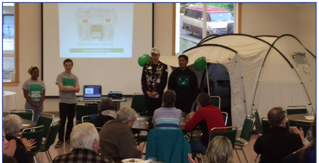
Rotary exchange students from all clubs host a Shelter Box breakfast fundraiser on May 7, 2016 included a presentation on the critical mission of providing shelter to those displaced by disasters around the world.

Thanks to AK Litho/CopyWorks, for printing The Windjammer!