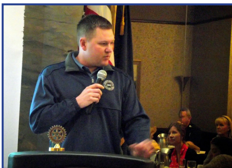
PHOTO FROM LAST WEEK'S MEETING