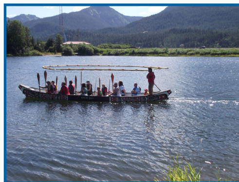
Glacier Valley Rotary Club Duck Derby on August 8, 2015