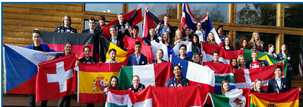
Fall Orientation at North Star Bible Camp up Hatcher Pass area outside of Willow.

Thanks to AK Litho/CopyWorks, for printing The Windjammer!