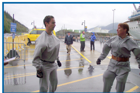
Juneau Rotary Clubs luncheon onboard the Star Princess on Sept 16, 2015