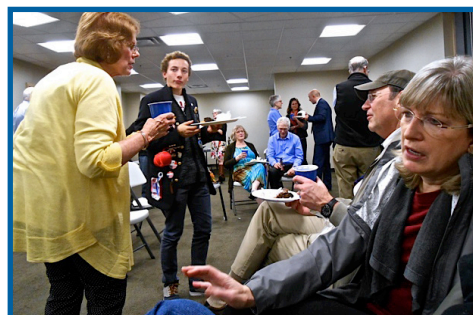
Rotary social at the Walter Sobeloff Center, Sept 15, 2015

Thanks to AK Litho/CopyWorks, for printing The Windjammer!