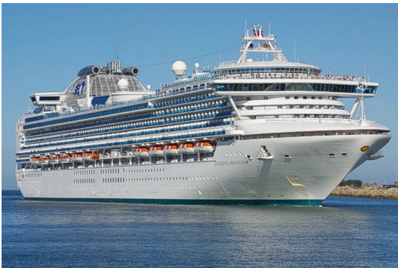
The Diamond Princess

The annual quad-club cruise ship luncheon is set for Sept. 17 aboard the Diamond Princess at the Franklin Dock, but signups must be received by today so security information can be sent in time.