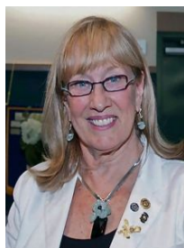
Right: KRBD Fundraiser⇒

Past President's last few months in this issue too.