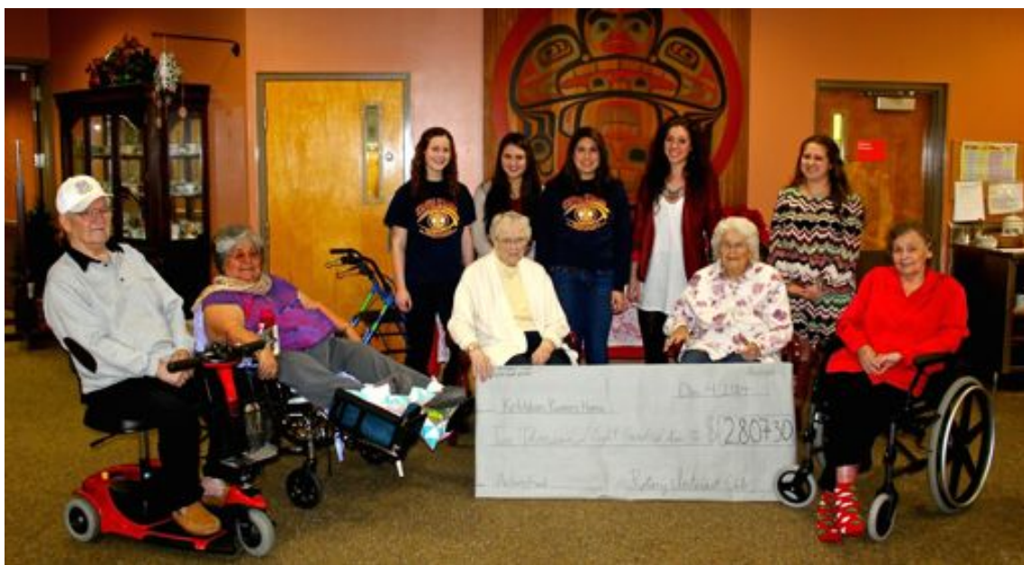
Interact delivering their $2807.00 check to Pioneer Home