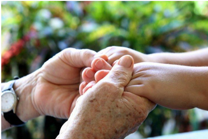
citizen residential facility in Arecibo, Puerto Rico.

In the second project ( Centro Geriatrico San Rafael, Inc in Areciba, Puerto Rico) the Malibu Rotary Club is the PRIMARY INTERNATIONAL PARTNER. This project costs $15,585.00 of which the Malibu Rotary Club and the Westchester Rotary Club have given $1170.00 each. Other partner clubs are Culver City, Wilmington, along with the host Rotary Club of Arecibo. The project involves upgrading equipment (mostly air conditioning) in a low income senior