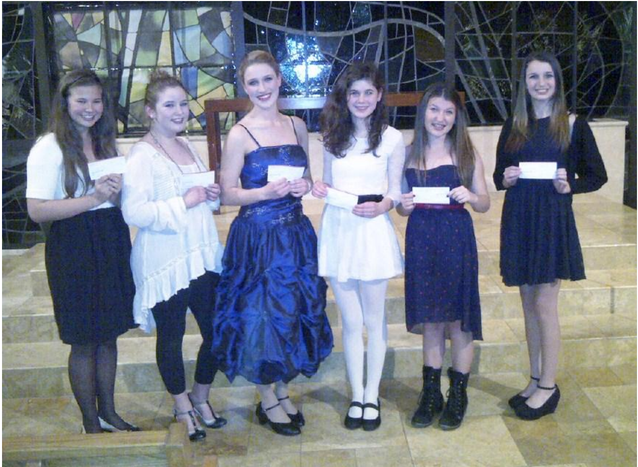
(Above) picture of winners from the 2012 Malibu Rotary Club Singing Competition at Stauffer Chapel

The 2014 Malibu Rotary Club Middle and High School Annual Singing Competition will held 6:30 p.m. January 16th at Stauffer Chapel at the Pepperdine University campus in Malibu.