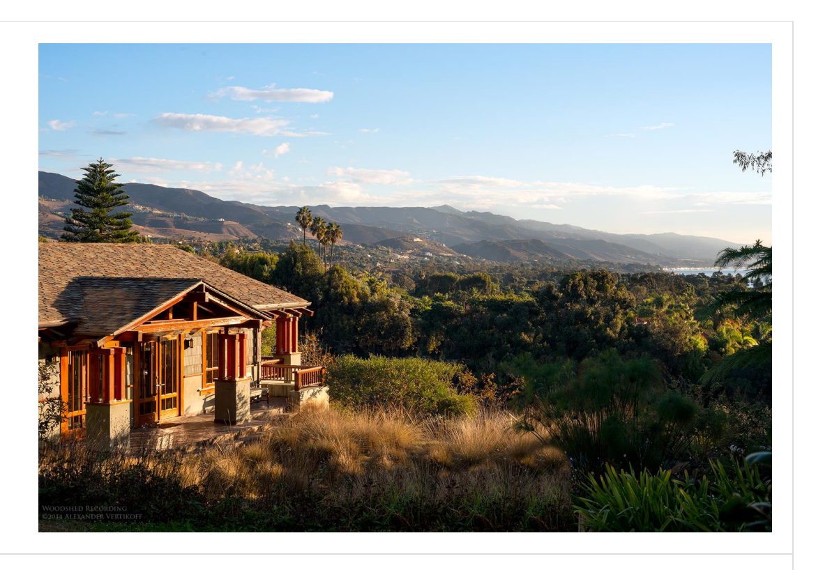
The pastoral setting of the studio includes a bubbling brook and koi fishpond.